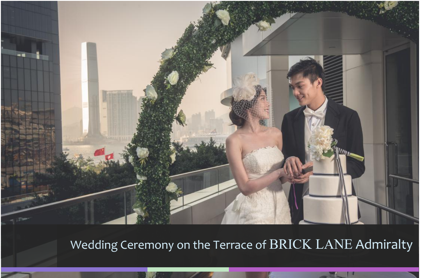
Wedding Ceremony on the Terrace of BRICK LANE Admiralty